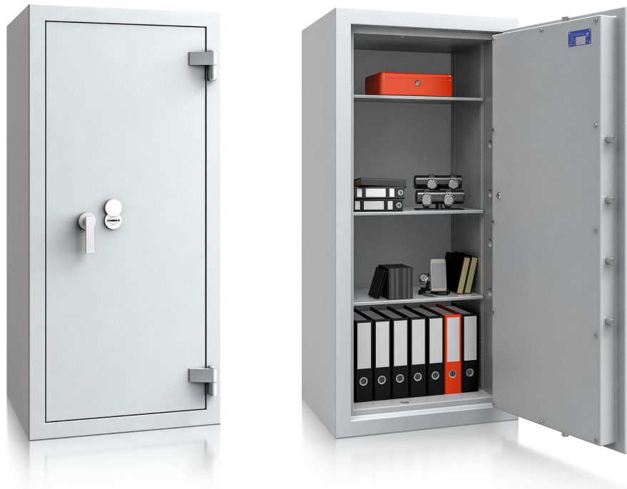
Model EN 0-160