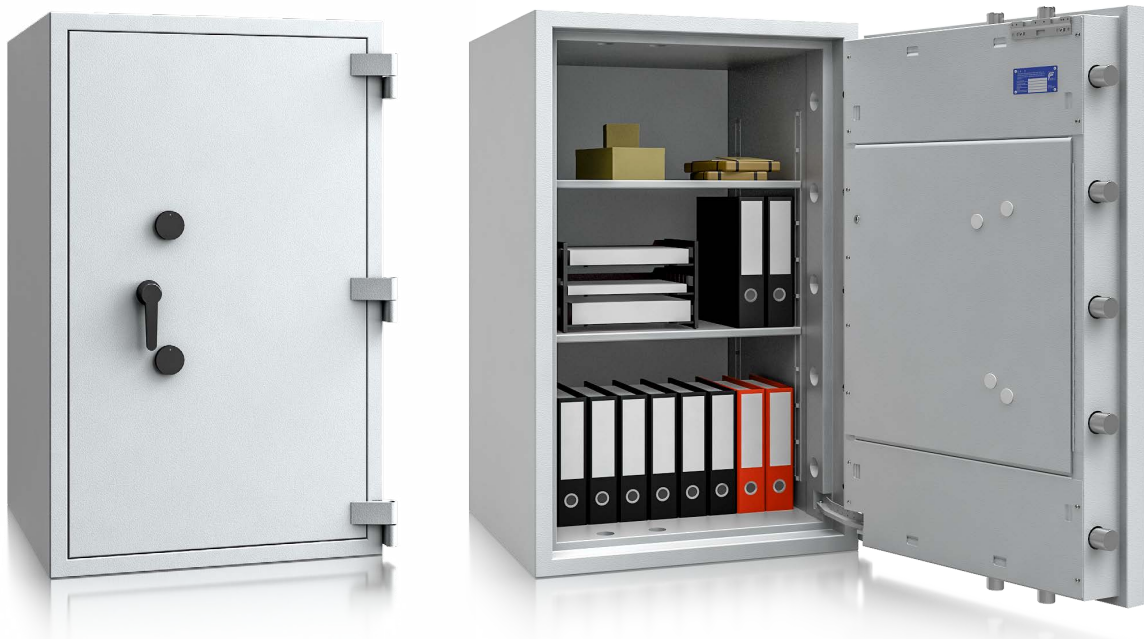
Model EW V-124