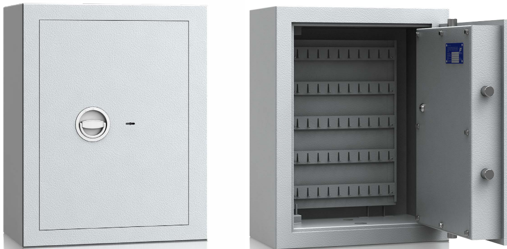
Model MST 0-100