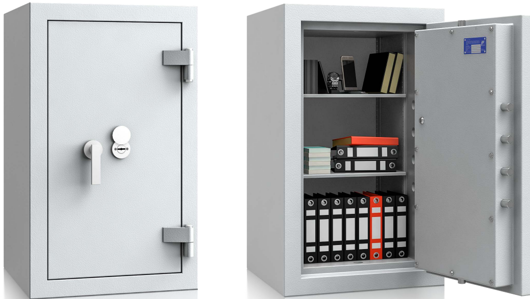
Model EN II-100